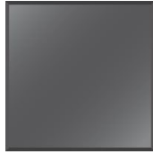
E65 GRIGIO EUROPA