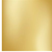
A30 ORO OPACO