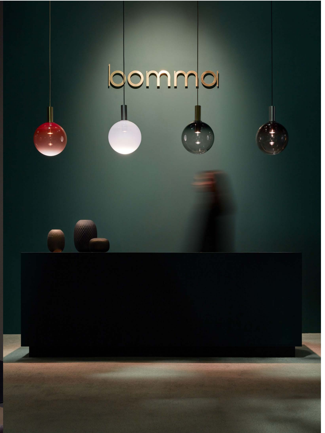
Divina at Light + Building 2024, Frankfurt