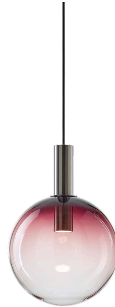
plum brushed silver