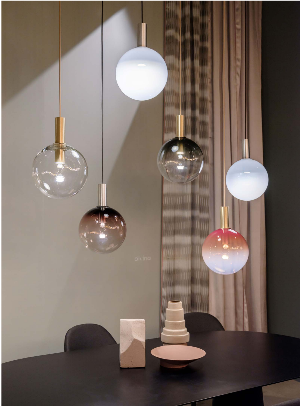
Divina at Salone del Mobile 2023, Milan