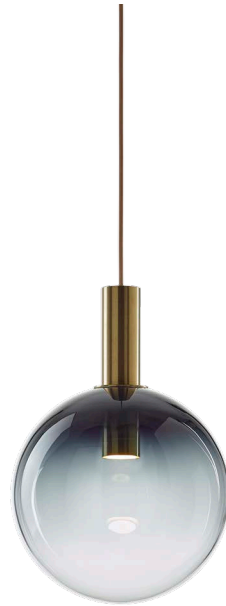
smoke brushed gold