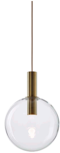
clear brushed gold