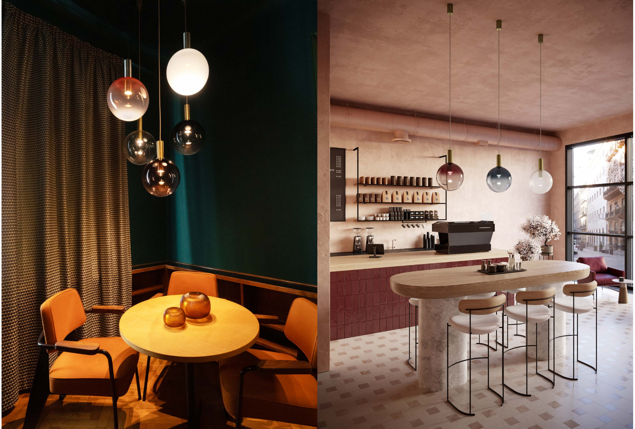
Divina at BOMMA Atelier, Prague