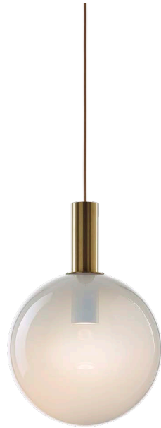
white brushed gold