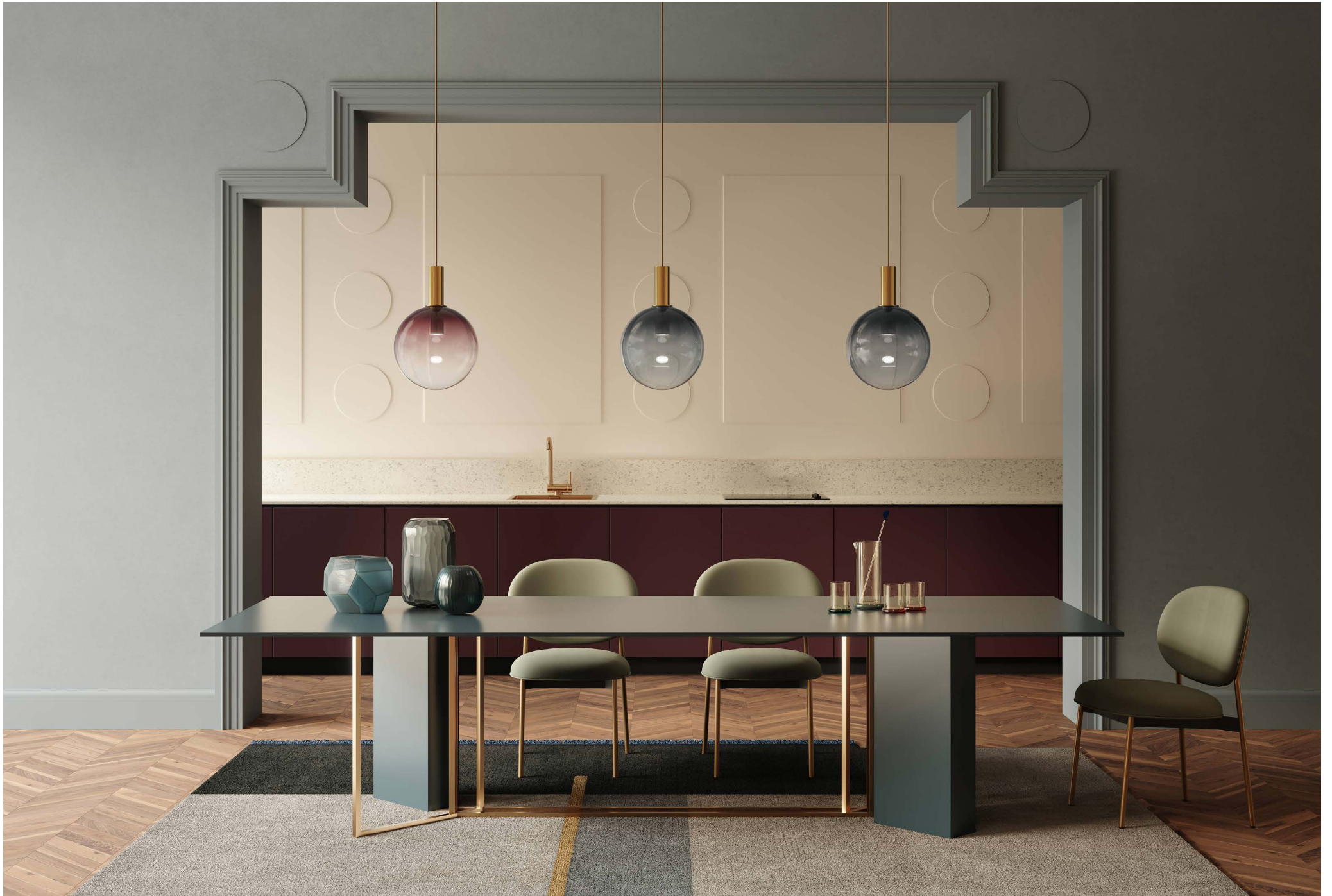
Divina in plum and smoke color, Image by Studio Salaris