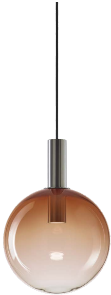
red orange brushed silver